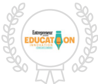
Education Innovation Award for Best E-Learning & Blended Solution -2022