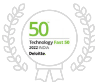
Ranked #18 in Deloitte Technology Fast 50 India - 2022