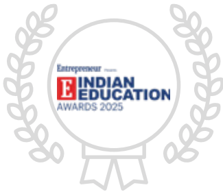
Best Upcoming Healthcare Education Company - 2025