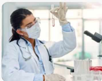
Medical Laboratory Technology