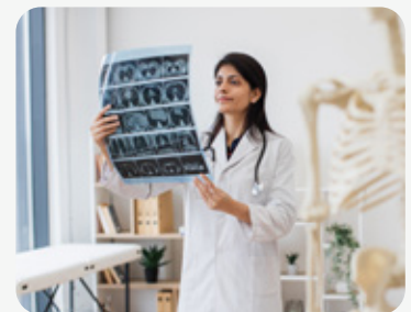
Medical Radiology & Imaging Technology