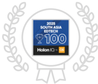
Top 100 EdTech startups in South Asia - 2025