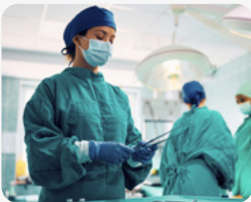
Anaesthesia & Operation Theatre Technology